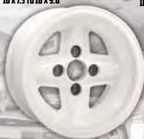
4 SPOKE RALLY