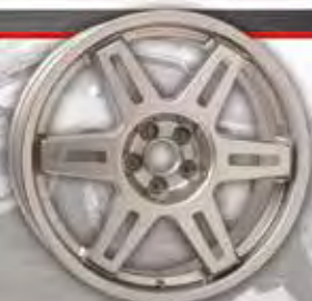
MILLENNIUM II RALLY

15 X 7.0 TO 15 X 8.0 / 16 X 5.5 TO 16 X 8.0 17 X 7.5 TO 17 X 9.0 / 18 X 7.5 TO 18 X 9.0