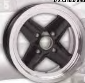
4 SPOKE RACE