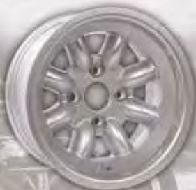
8 SPOKE RALLY

13 X 5.5 TO 6.0 / 14 X 5.5 TO 6.0 17 X 7.0 TO 8.0 / 18 X 7.5 TO 8.5