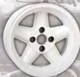
5 SPOKE RALLY