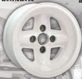
4 SPOKE RALLY