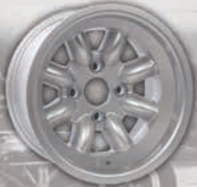
8 SPOKE RALLY

13 X 5.5 TO 6.0 / 14 X 5.5 TO 6.0 17 X 7.0 TO 8.0 / 18 X 7.5 TO 8.5