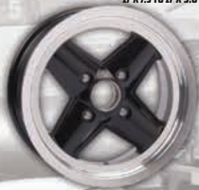
4 SPOKE RACE