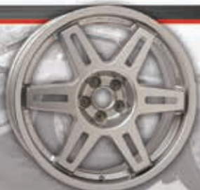
MILLENNIUM II RALLY

15 X 7.0 TO 15 X 8.0 / 16 X 5.5 TO 16 X 8.0 17 X 7.5 TO 17 X 9.0 / 18 X 7.5 TO 18 X 9.0