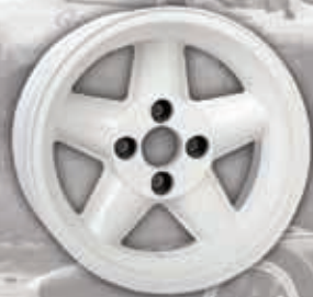
5 SPOKE RALLY